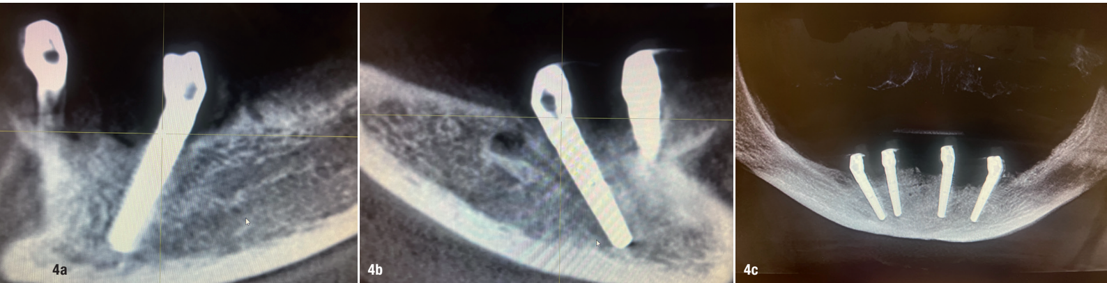
Figs. 4a–c: CBCT scan post-op.

The surface scan of the denture is performed when it is outside of the patient's mouth. The scan is taken using an intra-oral scanner. The CBCT and surface scans were taken in the same session to ensure that the Suremark stickers remained in the same place. After taking both scans, the stickers were removed.