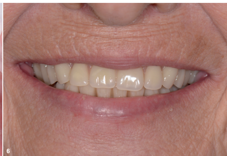
Figs. 5 & 6: Prosthetic and functional result.